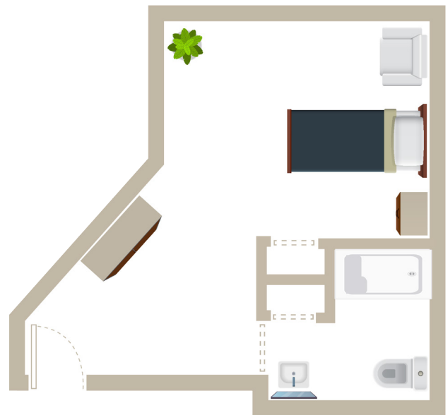
Private Studio #2